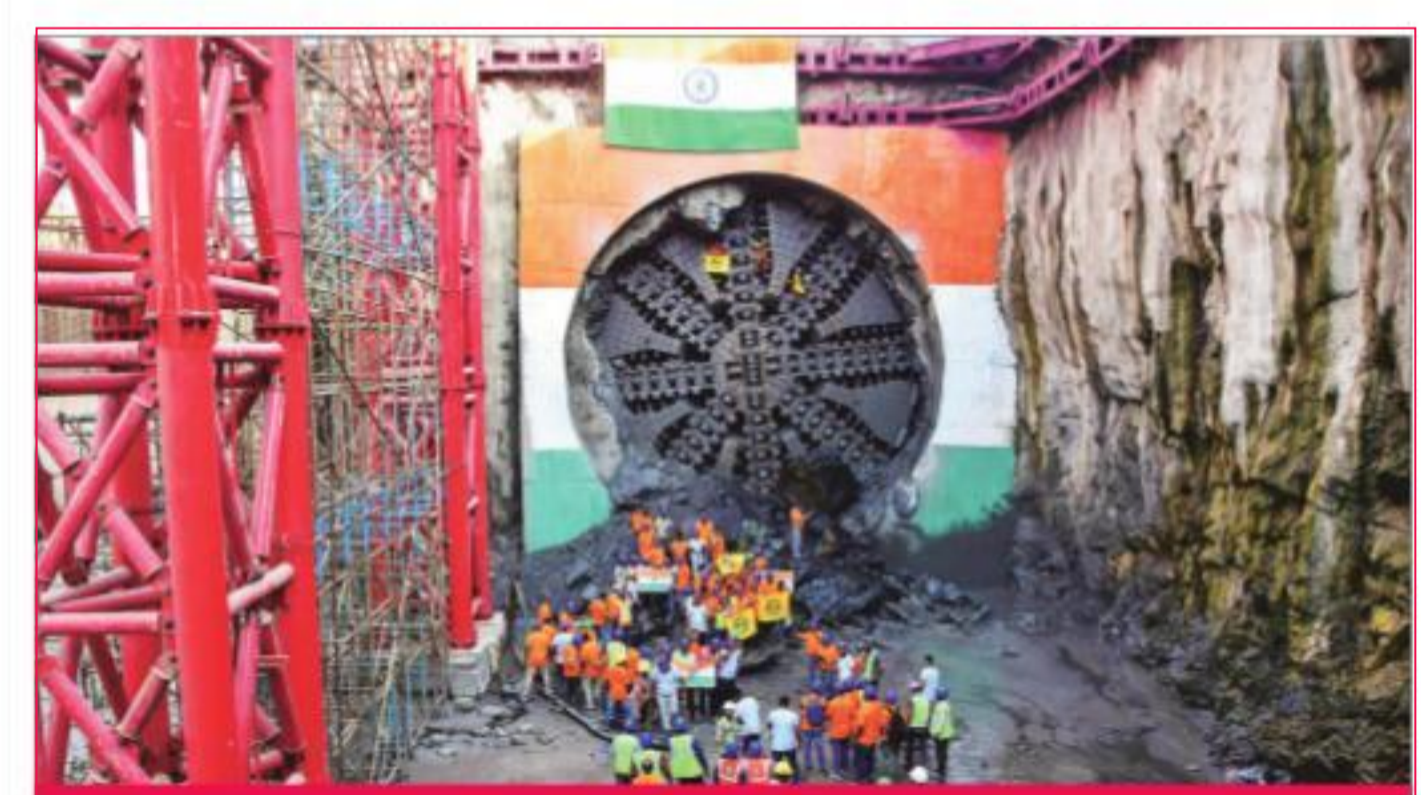
Workers and officials celebrate the breakthrough of the second tunnel from Swarajya Bhumi (Girgaon Chowpatty) to Priyadarshini Park of the Mumbai Coastal Road Project on Tuesday