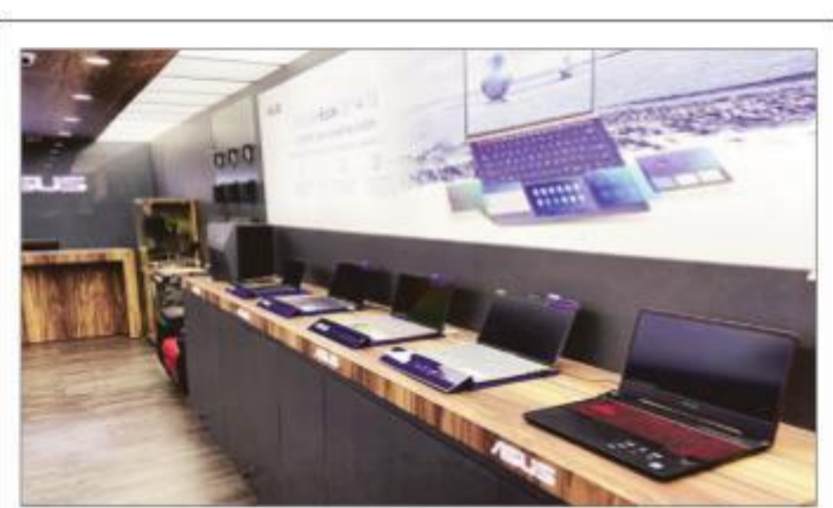
ATTRACTIVE ADD-ON FOR PLI 2.0

UNDER A NEW hybrid model, global IT hardware manufacturers will have the option to make investments of either ₹250 crore over a period of six years or ₹500 crore over the same period to claim incentives under the revised IT production-linked incentive scheme. Further, even domestic firms can opt for investing the amount of ₹250 crore under the hybrid model. In the older PLI scheme, the threshold for investments by global firms was ₹500 crore and for domestic firms ₹20 crore.